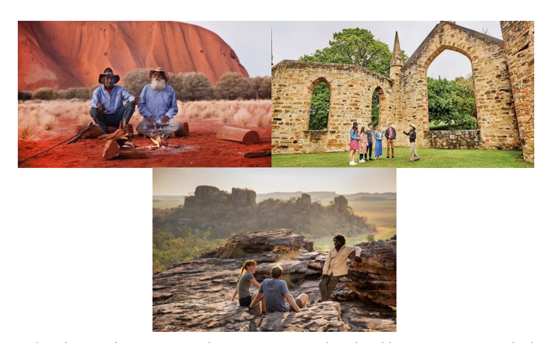
Left to right: Aboriginal tours; Port Arthur – Tasmanian cultural and heritage tourism; Kakadu Cultural Tours, Kakadu, Northern Territory © Tourism Australia.

In Australia, geotourism development is now being guided by the <u>National Geotourism Strategy (NGS)</u> of the <u>Australian Geoscience Council</u>. The Strategy has seven goals, which are being realised by multi-disciplinary work groups comprised of members of local, State/Territory and Australian government agencies, tourism and heritage professionals, NGOs, universities, industry groups, consultancy professionals, and resources industry organisations. These goals align with UNESCO's SDGs in many ways and are promoting and are seeking government approval for geotourism ventures, sites, experiences, and concepts (Goal 2) via digital platforms (Goal 1), geotrails (Goal 3), protected areas and national parks experiences (Goal 4) and in areas with mining and cultural heritage (Goal 5). These areas can be better interpreted to enable interested operators and tour guides to communicate geotourism concepts (Goal 7), and how quality Australian geotourism experiences can be showcased internationally (Goal 6).