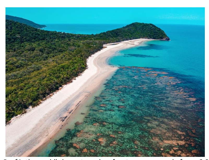
The Great Barrier Reef is the world's largest coral reef system, composed of over 2,900 individual reefs and 900 islands stretching for over 2,300 kms over an area of approximately 344,400 sq kms.

Because 'the Earth' is the focal point for geotouristic sites and experiences, most are situated in areas of aesthetically pleasing, culturally significant or notable landscapes or landform elements. Mountains, caves, rivers, reefs, sand dunes, even novel soils that produce heritage grape varieties are often focal points around which geotourism sites and experiences are situated. Tourists who engage in these experiences often do not realise that they are taking part in a geotouristic experience or a place of high geotourism value, but when we are encouraged to think about all of the big Australian touristic experiences through the lens of geotourism – we can see just how many there are located here in Australia!